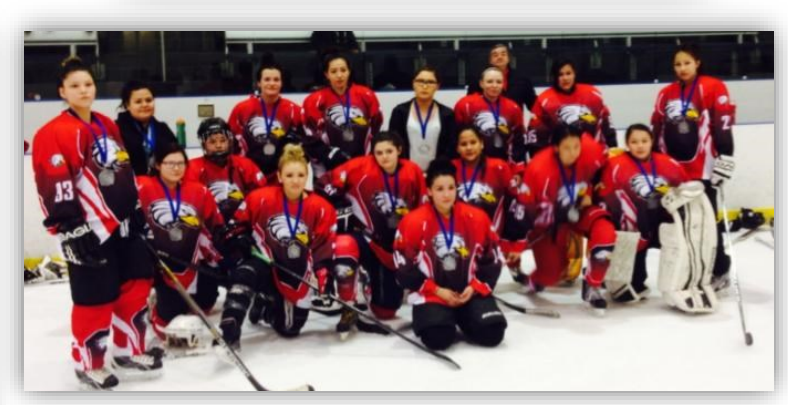
ANH Jr. Girls