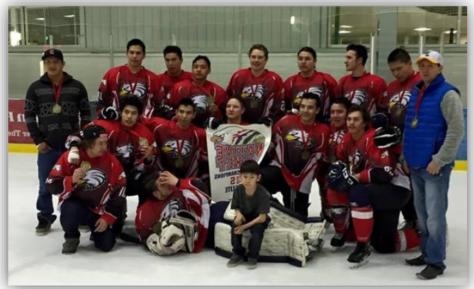
ANH Jr. Boys