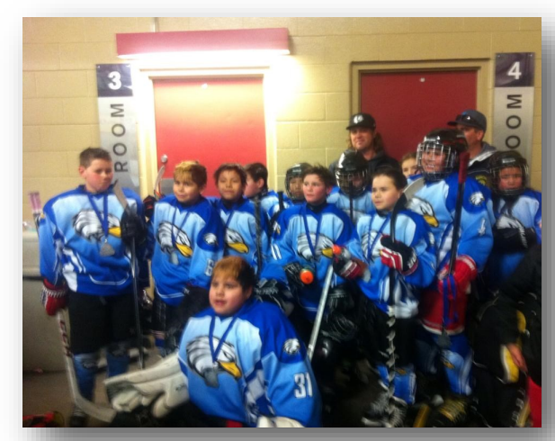
ANH Atom A